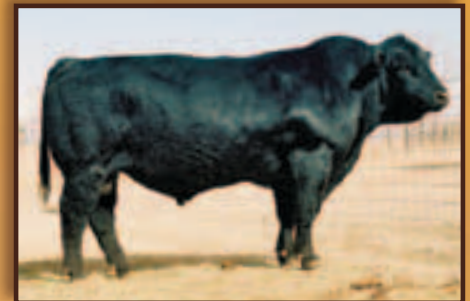
ASR Little Bear L126