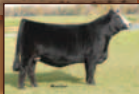
MTTR Ms Jenny 521W full sister to Built Like A Dream - reference