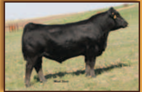
GW Paramount 718Y