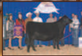
Sedgwicks Erica U332 - reference dam