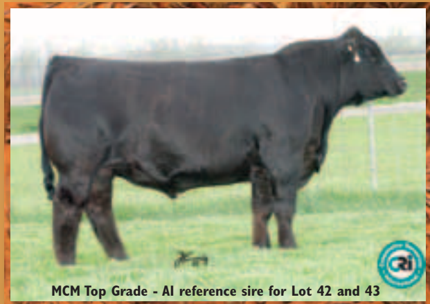
MCM Top Grade - AI reference sire for Lot 42 and 43