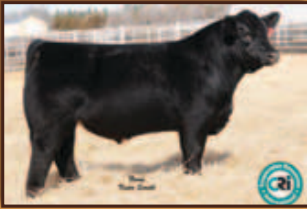
W/C Wide Track