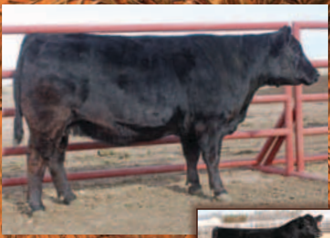
W/C Wide Track 694Y - reference sire