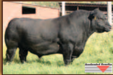
GW Predestined 701T